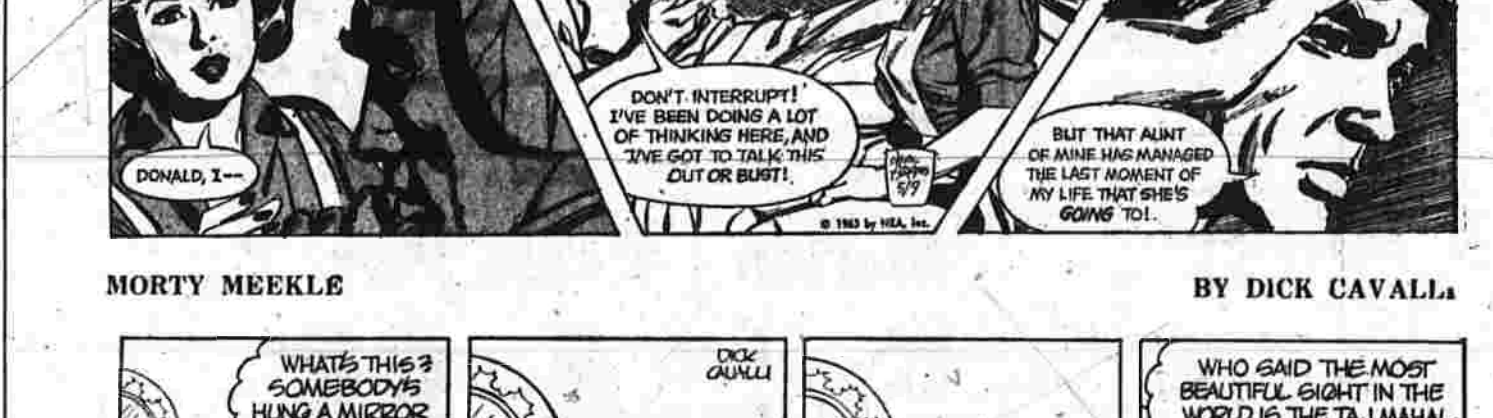
MORTY MECKLE BY DICK CAVALLA